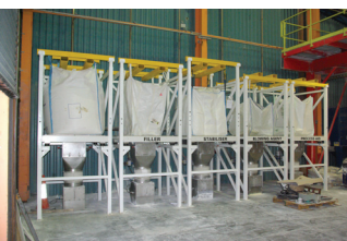
FIBC DISCHARGE SYSTEMS

UK Manufactured FIBC discharger with options to suit any application