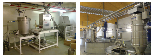
REFILL & CONVEYING SYSTEMS