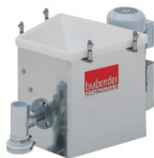
FlexWall®Plus Feeder FW80

* Theoretical values at 100% screw filling level and motor speed. Depending on the flow characteristics the screw filling level may decrease to 50%.