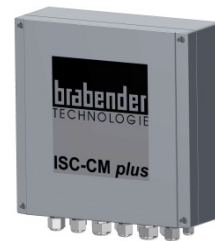
ISC-CM plus control module