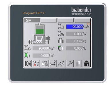
Congrav® OP 1T

Please refer to the appropriate Works Standard for further details.